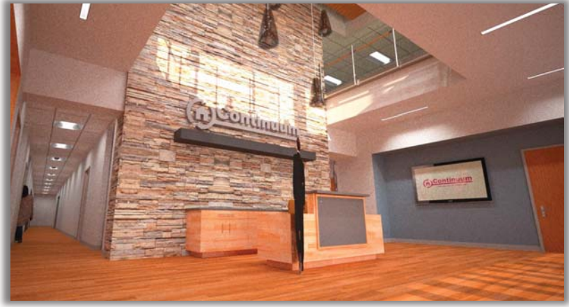
This is what the reception area will look like.

The main entrance will be comprised of store-front glass and a glass vestibule, which lead to a custombuilt reception area showcasing an impressive twostory stone wall. This wall represents a hearth (or a fireplace wall) that, along with a hardwood ceiling and vinyl wood flooring in the reception area, is intended to make our new space feel more like a home and less like a corporate office. The building's earth-tone colorway of blue-grays, tans, browns and green-grays, and the abundance of sunlight coming through the many windows, will also create a warm, hospitable environment for visitors and staff. Artwork and photographs will be featured in each floor's break room to showcase the people of Continuum.